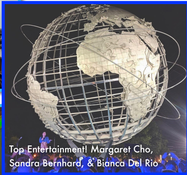
Top Entertainment! Margaret Cho, Sandra Bernhard, & Bianca Del Rio