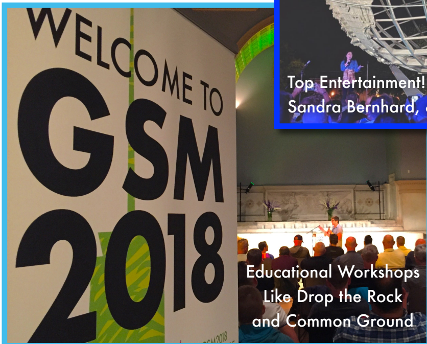
Educational Workshops Like Drop the Rock and Common Ground