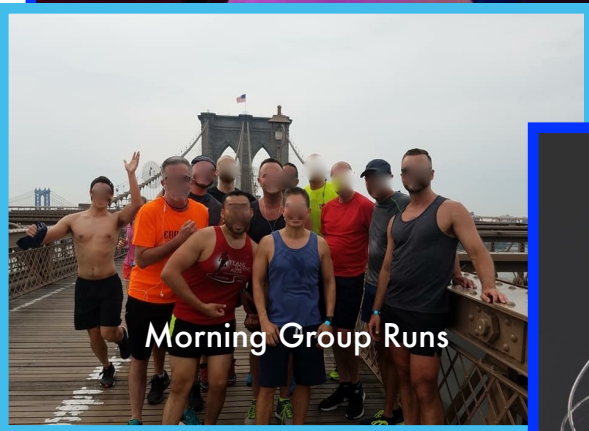
Morning Group Runs