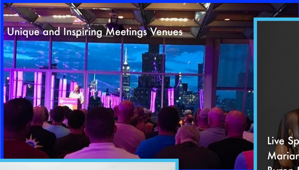
Unique and Inspiring Meetings Venues

The Gay & Sober Men's Conference is three days of meetings, health & wellness workshops, speakers, and fun activities devoted to gay men in recovery from alcoholism and drug addiction. A prime objective of the conference is to bring participants closer to one another. 500 - 600 attendees from all over the world.